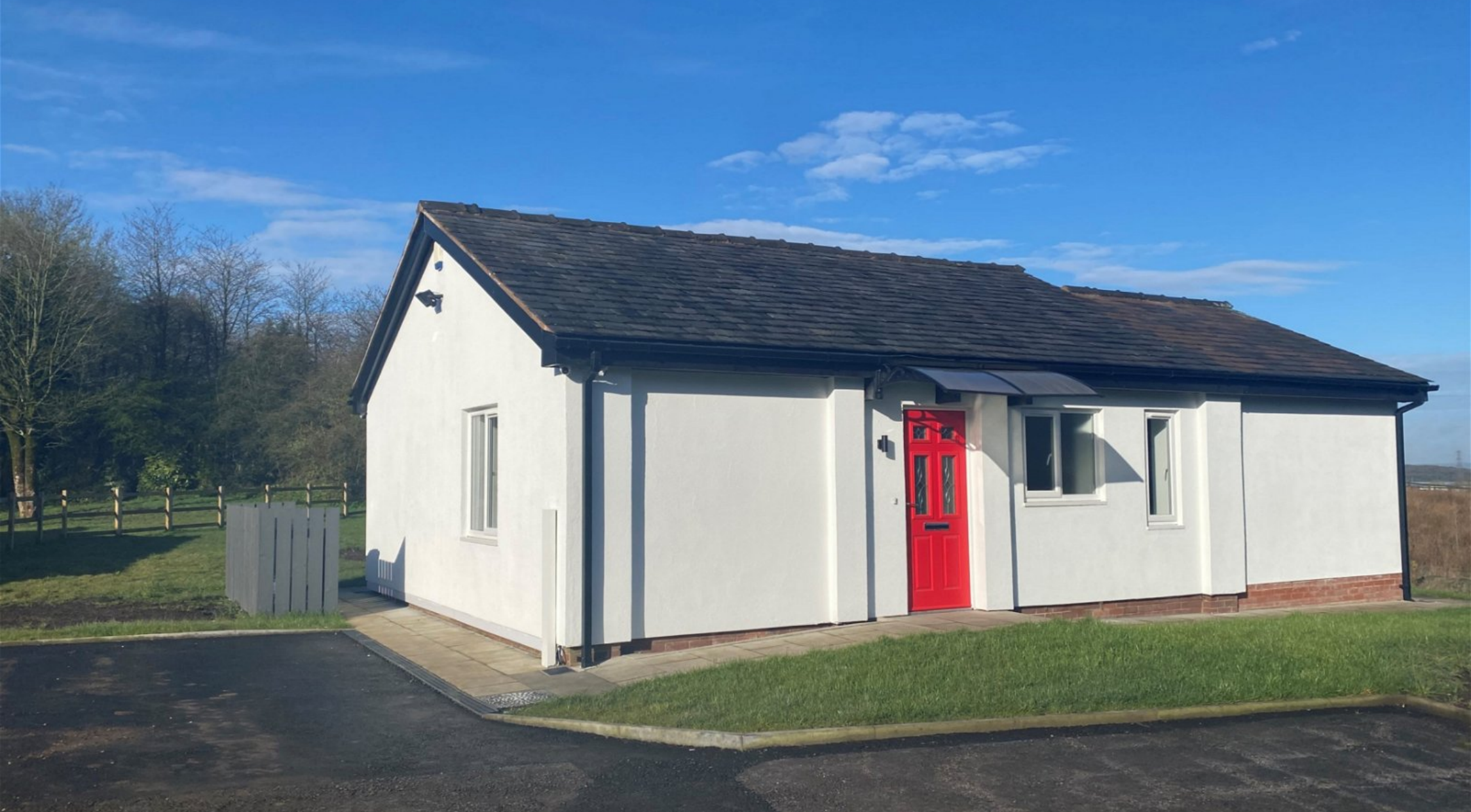
Laburnham Bungalow, 27 Chadderton Heights, Healds Green, Chadderton